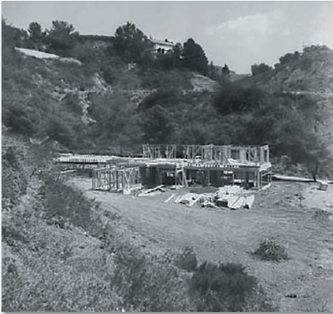
The framing stage of construction for my new childhood home. Beverly Hills, 1951.