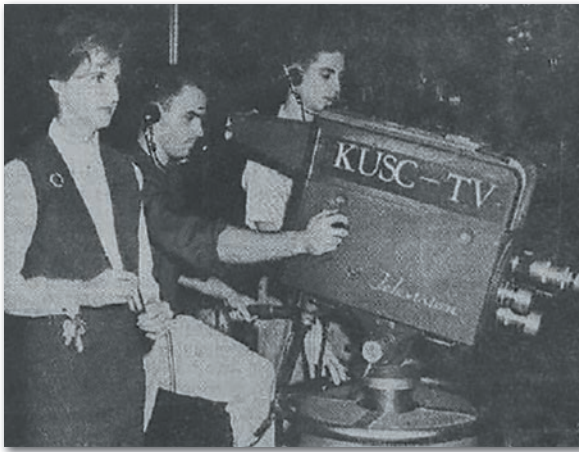
As Station Manager, I'm seriously supervising the camera action at KUSC-TV. Los Angeles, 1961.